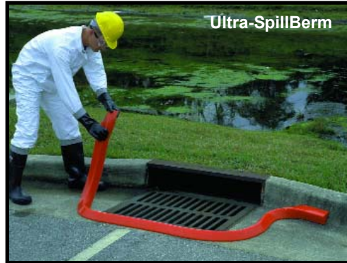
Spill Response Products