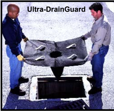
Catch Basin Inserts